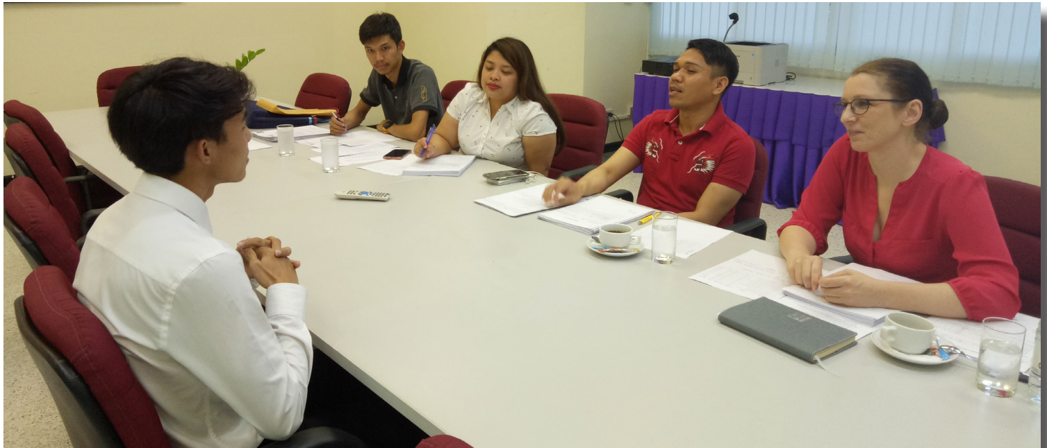
Pictured below: FHT students making 10th Anniversary of AIMS Programme video clip